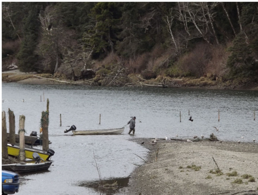
Fig 1 Map showing tribal lands in the western USA and the locations of the five tribes on which this study was based

The lead author interviewed 24 members of the five tribes. The participants were chosen based on their